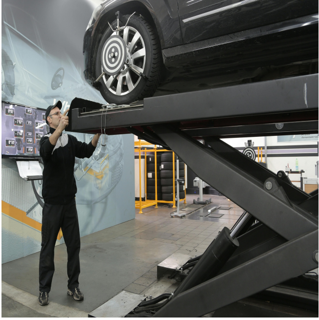
business since 1984 and managed by current owners since the '90s. It is one of the few established shops in the Central New Mexico Mountains and has made a name through extensive and special services offered.

This successful Automotive and Tire center has been in